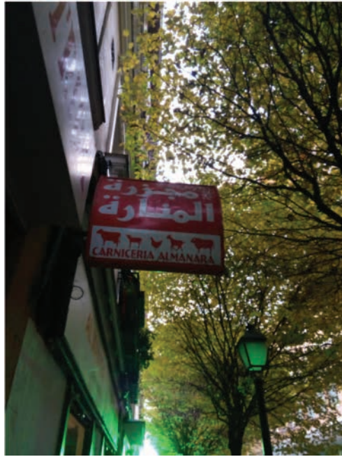
Figure 3: Sample 138