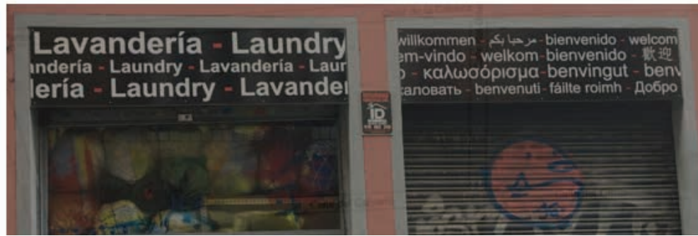
Figure 5: Sample 51

The previous cases are not examples of ethnic economies or identity creation and negotiation; however, it is interesting to see how multiculturalism has become a business strategy. Such as the notorious advertising campaigns by Benetton , where interculturality was the main marketing strategy.