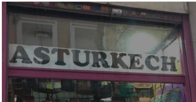
Figure 10: Sample 38

Another type of business that proliferates in Lavapiés are craftwork shops that amount to 6.4% of the total (Samples: 18, 32, 33, 34, 37, 38, 112, 121, 135). These are ethnic economies, mainly focused on customers outside their cultural group. All the linguistic signs are in Spanish, and, since most shops sell Native American products, we can once more see the legacy from old colonial times, although this time, the footprint is Spanish and not French, as in the case of Figure 7, Sample 99.