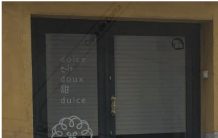
Figure 4: Sample 24

This example –not the only one– is evidence of the gentrification process rather than of the immigration related LL. As mentioned in the previous section, Time Out chose Lavapiés as one of the coolest neighbourhoods in the world, mainly due to its multiculturalism. Businesses not related to ethnic economies are taking advantage of the new population readjustment as a tactic to attract customers.