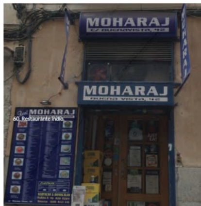
Figure 9: Sample 60

This is the largest group of activities recorded in the Linguistic Cartography and accounts for 24% of the overall amount (Samples: 2, 3, 10, 19, 26, 36, 53, 58, 59, 60, 61, 62, 64, 65, 69, 75, 77, 79, 81, 83, 84, 85, 87, 88, 89, 91, 96, 97, 102, 106, 107, 109, 115, 132). The language that registers a larger number of repetitions is Spanish, present in 85% of the samples. Followed by Bengali, English, Italian, Arabic and Chinese.