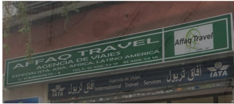
Figure 2: Sample 6

According to the results obtained by Calvi (2018) in a similar study conducted in Milan, geographical locations and the use of different languages are a tactic to make immigrants feel identified, and to privilege these linguistic and cultural groups, as the main commercial target, although, as pointed out by the same author, it is not the most common strategy.