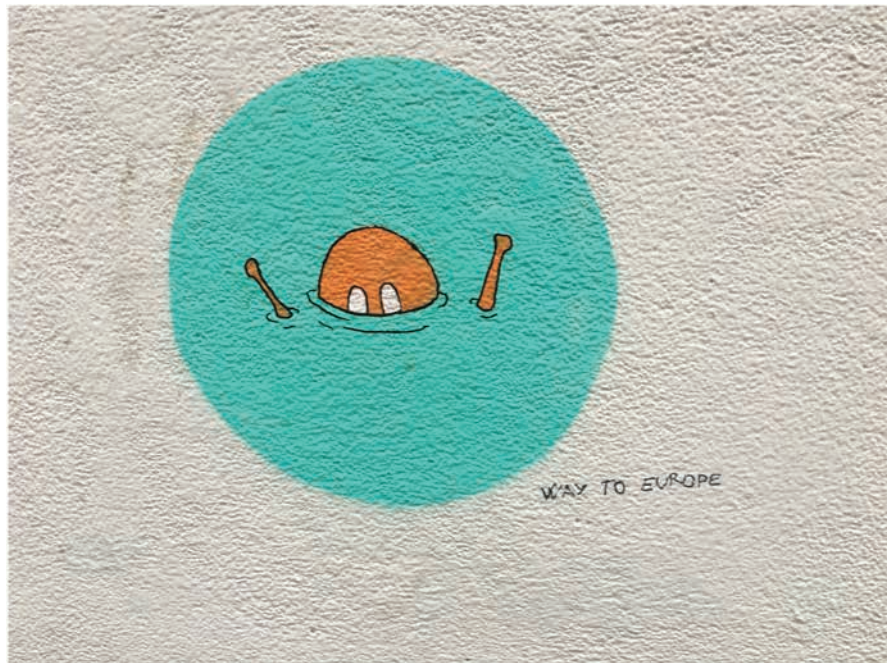
Figure 12: Sample 5

This first group of graffiti (Samples: 5, 109, 140, 42) comprises three graffiti with a combination of images and words. As seen in Figures 13, 14 and 15, the language of the text is not relevant, since the images are self-explanatory.