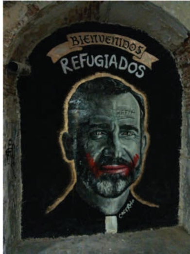
Figure 13: Sample 140

from Africa and Asia every year and, by extension, against the European and national policies regarding this matter (Arango et al. 2018).