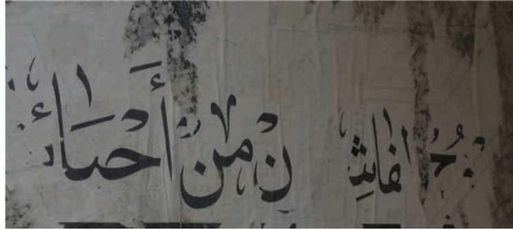
Figure 11: Sample 63

Sample 63 reflects how ephemeral these type of signs are. This is closely linked to the fact that they are bottom-up communication strategies, not issued directly by the authorities and, hence, not placed on billboards. In fact, they tend to use spaces illicitly to post their material.