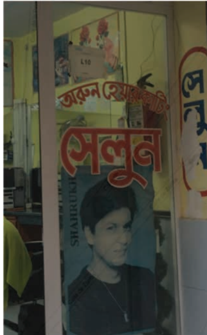
Figure 8: Sample 4