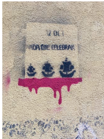
Figure 14: Sample 42

Sample 140 is a graffiti of the current Head of the Spanish State with the Joker's smile drawn on his face, accompanied by the text: " Bienvenidos refugiados " [Welcome Refugees]. Technically, he is a first generation Spaniard, since both his parents were refugees.