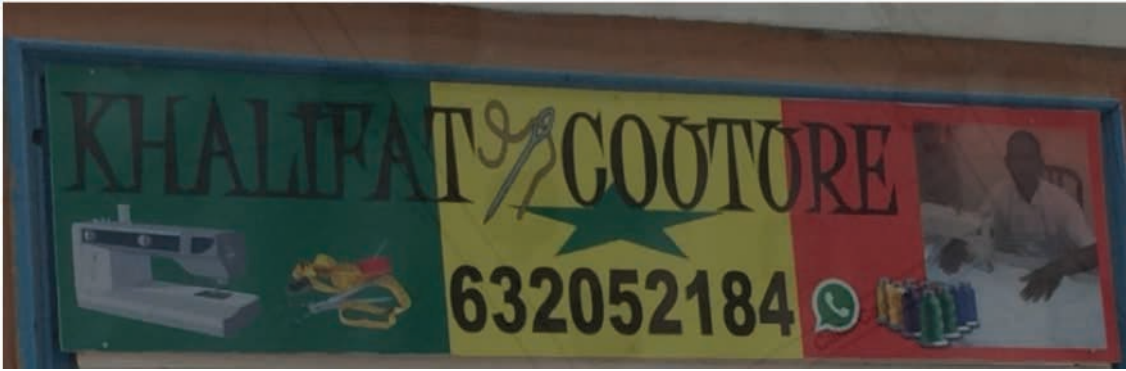
Figure 7: Sample 99

The name is very revealing: on one hand, it is in French, the official language of Senegal, one of its many colonial legacies; similar to what happens with shops from Latin America. On the other hand, the world Khalifat is extremely culturally bounded, since it refers to the territory governed by leaders who practise Islam, the most spread religion in Senegal.