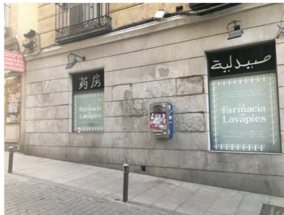
Figure 6: Sample 9

Figure 6, the chemist's, even though it is not part of the ethnic economy, differs from Sample 51 and 72. In this case, the Spanish owners of the establishment use both Chinese and Arabic, iconically, in order to “reconoce(r) y legitima(r) su existencia” [recognize and legitimize their existence] (Moustaoui Srhir 2018: 216), thereby acknowledging the diversity present in the area.